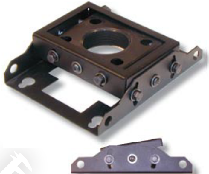
Adjustable +/- 20° tilt & pitch, 360° yaw

See the following pages for mount accessories